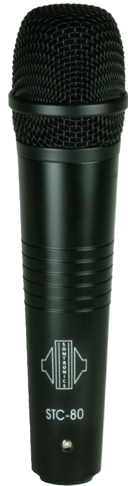
Frequency Chart: STC-80

The STC-80 is Sontronics' first handheld dynamic microphone. It boasts the same rugged construction as Sontronics' handheld condensers and offers a high-quality dynamic capsule. The STC-80 has a solid feel with superb sound quality and low handling noise. It delivers first-class results on stage and in the studio. While ideal for vocals and speech, the STC-80 also performs well as a direct microphone for guitar cabinets, snare drums, and toms. Its internal pop filter effectively reduces plosive sounds. The STC-80 is packaged in an aluminum flight case for ultimate protection on the road.